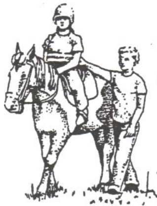
incorrect sidewalker position

SAFETY RULE #2: Do not lean on the horse.