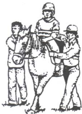
correct sidewalker position

SAFETY RULE #1: Do not walk behind the saddle next to the horse's hindquarters!